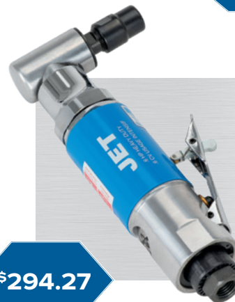
JET402113 .6 HP 1/4" HEAVY-DUTY 90° ANGLE HEAD DIE GRINDER