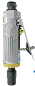
JET402109 .3 HP 1/4" MINI DIE GRINDER