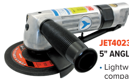
JET402305 5" ANGLE GRINDER