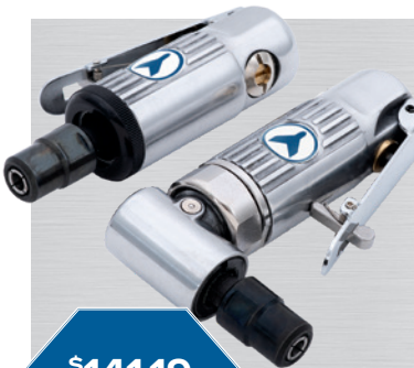
JET402148 2-IN-1 MINI DIE GRINDER COMBO