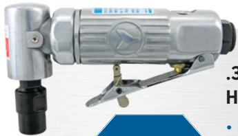
JET402110 .3 HP 1/4" MINI 90° ANGLE HEAD DIE GRINDER