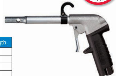
DGI PART NO. GRDU75LJ006AA2