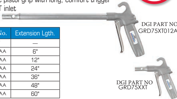
DGI PART NO GRD75XT012AA