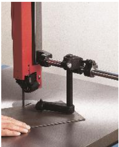
Disk Cutting - 402080