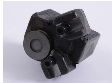
Typical Guide Block