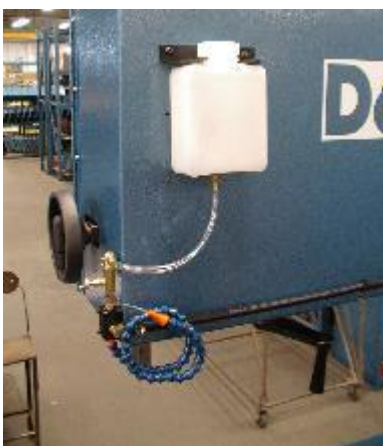
Mist Lubricator – 420288