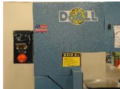
Blade Welder – 299550/299551