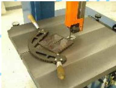
Work Holding Jaw - 5-013007