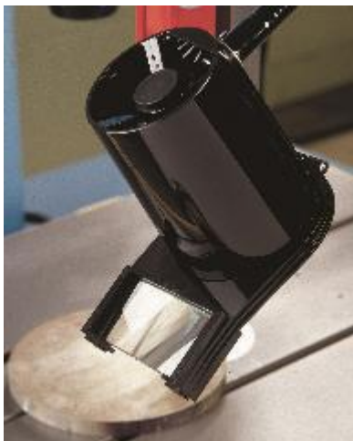
Magnifying Attach – 138436