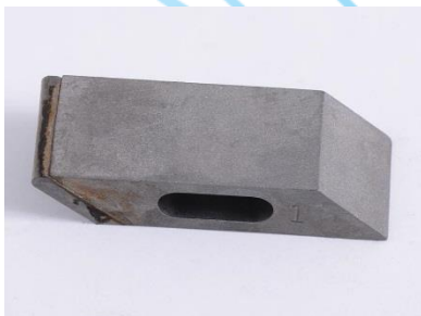
Typical Guide Insert