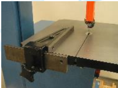
Rip Fence – 47779