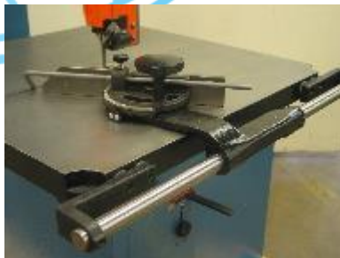
Mitering Attachment – 55305