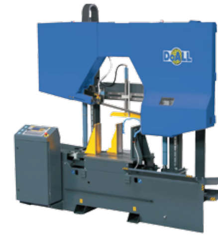
DoALL TDC-600SA Olympia Tube Saw – 24" Tube Capacity