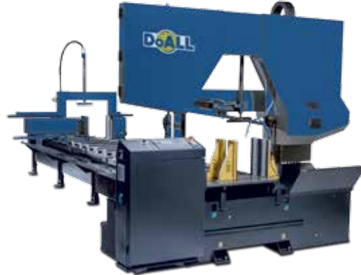
DoALL TDC-600CNC Olympia Tube Saw – 24" Tube Capacity