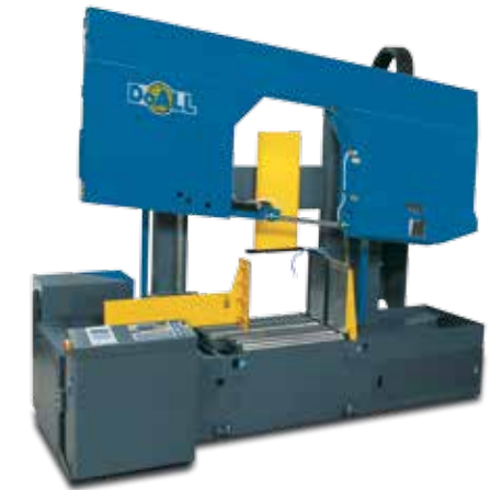
DoALL TDC-1000SA Olympia Tube Saw – 40" Tube Capacity