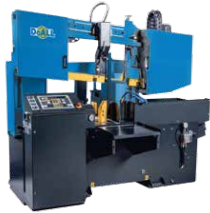
DoALL TDC-400CNC Olympia Tube Saw – 16" Tube Capacity