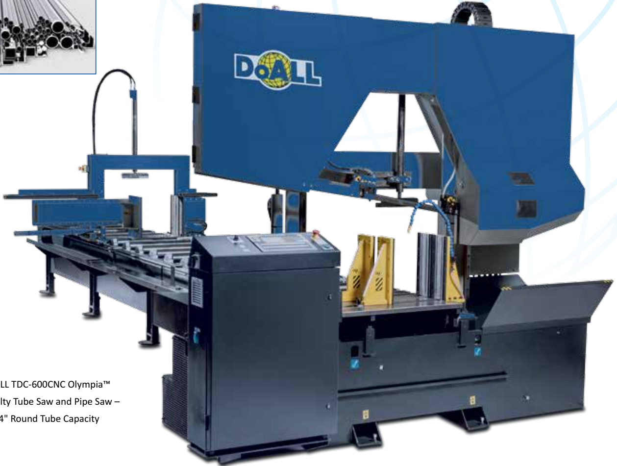
DoALL TDC-600CNC Olympia™ Specialty Tube Saw and Pipe Saw – 24" Round Tube Capacity